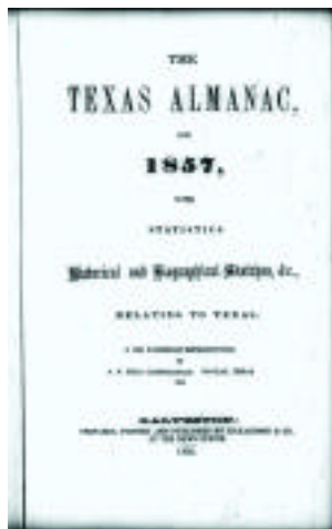
See it for yourself: On-line demos. Texas Almanac title page, above and book page, below

Time isn't the only potential savings you'll find. Using the iArchives process costs far less than most traditional archiving or information retrieval methods. (In fact, digitizing a page using the searchable iArchives process costs about as much as photocopying it.) Plus, iArchives images require no maintenance or re-filing, are immediately accessible,